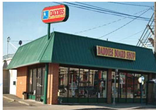
Daddies Board Shop

The 2011 calendar is about to be created, and we want to show off your Kahuna board riding pictures in it! Send high-quality pictures to photos@kahunacreations.com , and we'll put the best ones in the calendar. The deadline for photo submissions is October 15, so make sure you get pictures in before then.