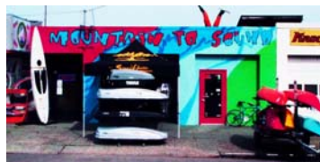
Mountain to Sound Outfitters